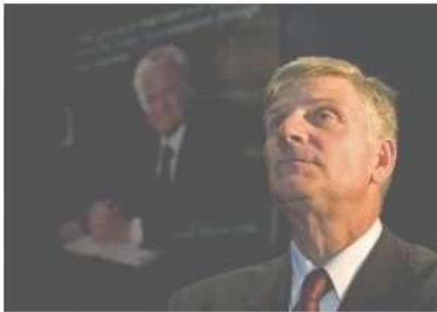
Reverend Franklin Graham views the Russian air strikes as a means to protect persecuted Christians.

Email Print Share Like 260 Tweet +1 Recommend this Pin it